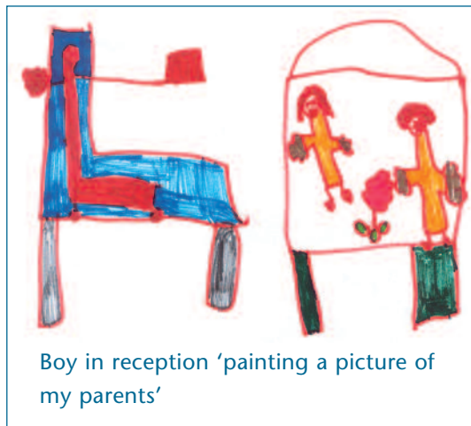
Boy in reception 'painting a picture of my parents'

The interviews with parents suggested that parents had an important role in reassuring their children and preparing them for year 1, but this was more difficult to achieve in the absence of information from the school. On the other hand, providing parents with information and opportunities to meet their child's new teacher helped to reduce anxiety and enabled parents to support their children during transition.